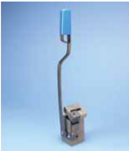
"A" Price Key Mold Includes Hold Down Frame

Pictured below are the molds and handle clamps / and or frames and handles for the various price key molds: