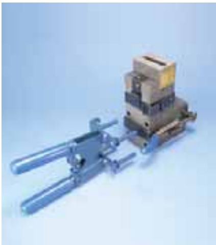
"E" and "J" Price Key Mold L160 or L159 Handle Clamp Required