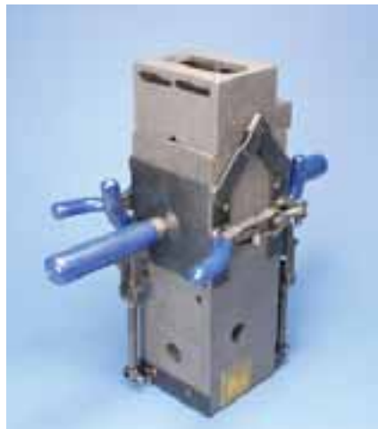
"M" and "V" Price Key Mold Includes Frame with Handles