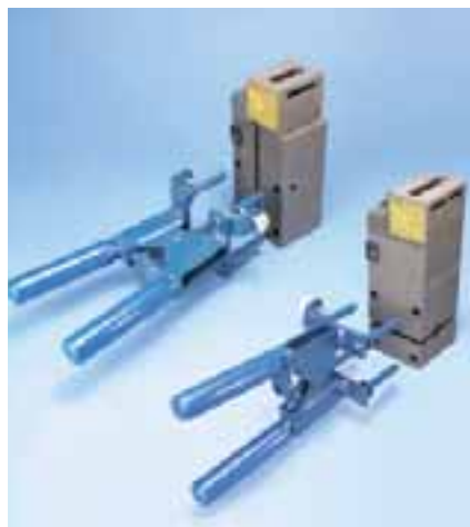
"C", "D", "F", "R", "Q" and "Z" Price Key Mold L160 or L159 Handle Clamp Required